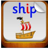
Read with Phonics

We use the following apps to support phonics and spelling in school: